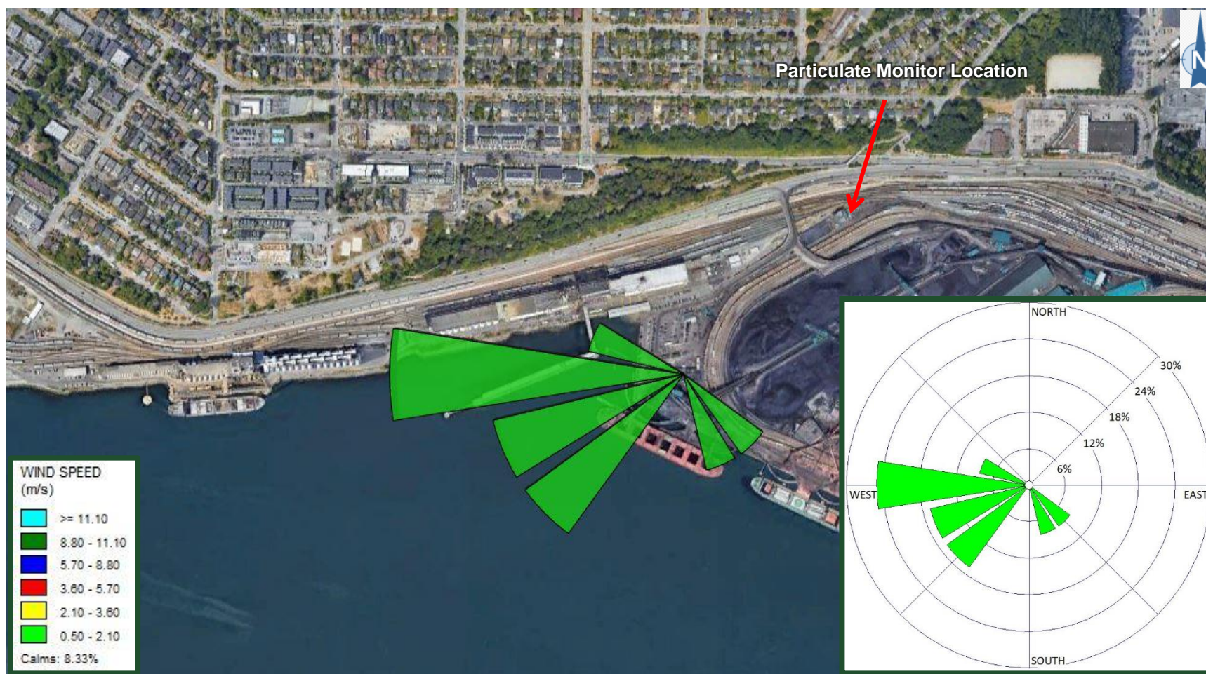
Figure 3: Wind rose during hours contributing to PM 10 24-hr rolling average AAQO exceedance with PM 10 concentrations greater than 50 µg/m 3 for the first calendar quarter (January 1 st to March 31 st , 2023)

Note: The presented wind rose is based on "winds blowing from"