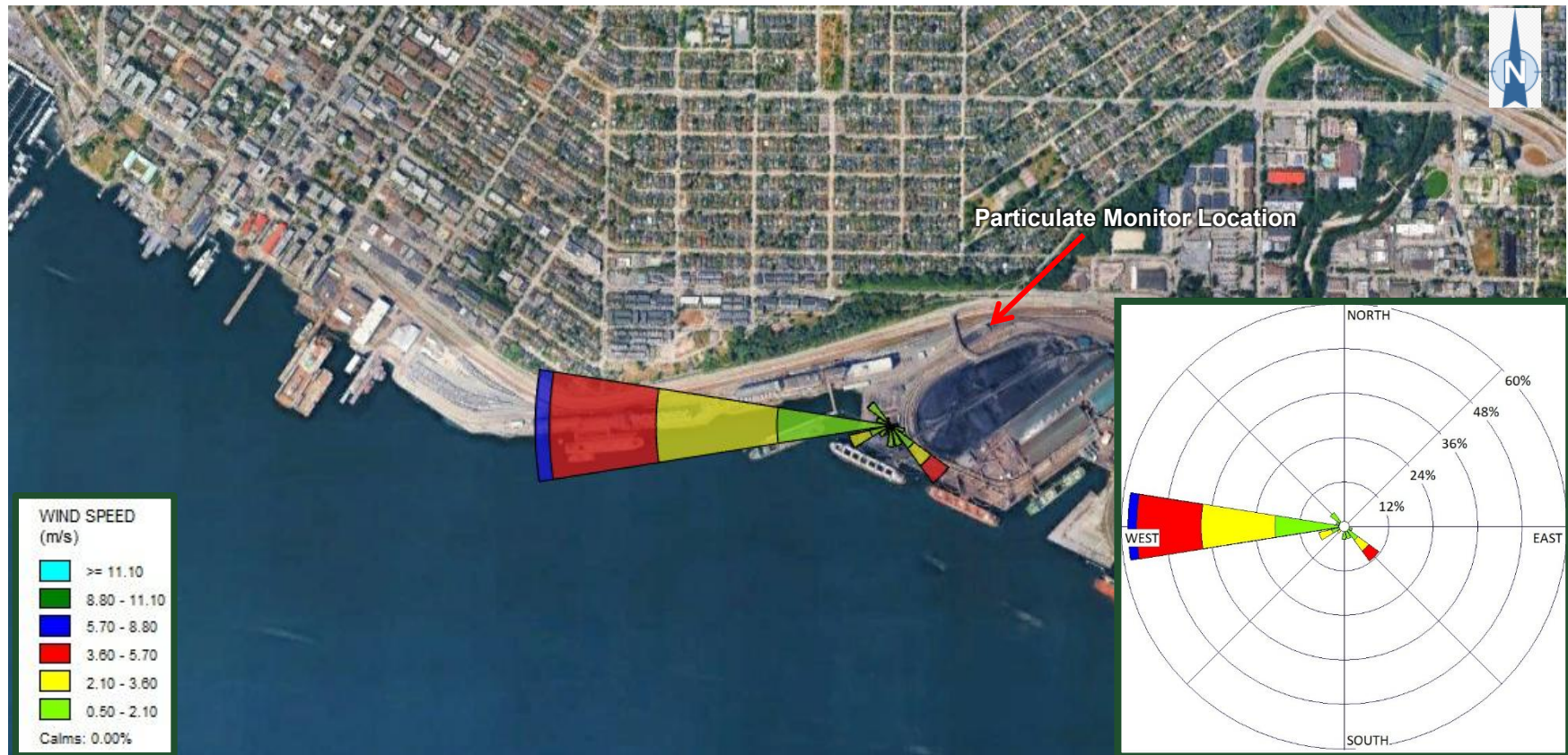
Figure 3: Wind rose during hours contributing to PM 10 24-hr rolling average AAQO exceedances with PM 10 concentrations greater than 50 µg/m 3 in the second calendar quarter 2025 (April 1 st to June 30 th , 2025)

Note: The presented wind rose is based on "direction winds blowing from"