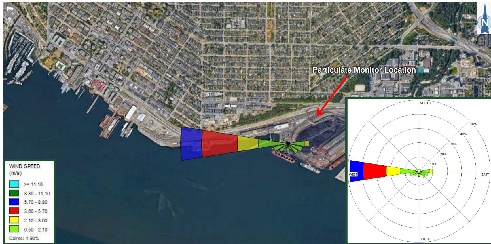
Figure 3: Wind rose during hours contributing to PM 10 24-hr rolling average AAQO exceedances PM 10 concentrations greater than 50 µg/m 3 in the third calendar quarter 2024 (July 1 st to September 30 th , 2024)

Note: The presented wind rose is based on "winds blowing from"